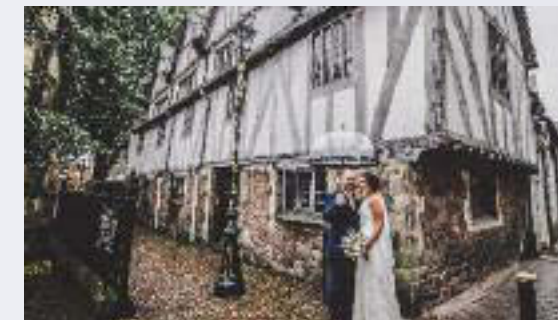
The Guildhall page 8