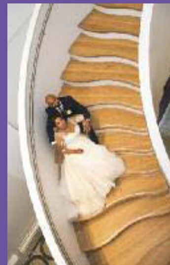
New Walk Museum & Art Gallery 53 New Walk Leicester LE1 7EA T: 0116 225 4900