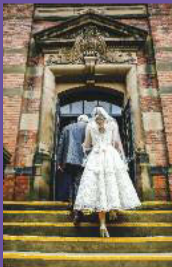
Abbey Pumping Station Corporation Road Leicester LE4 5PX T: 0116 299 5111