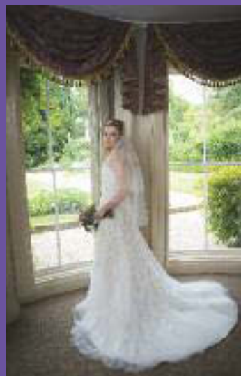
Belgrave Hall & Gardens Church Road Leicester LE4 5PE T: 0116 229 8181