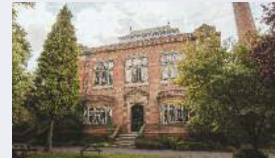
Abbey Pumping Station page 4