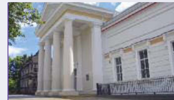
New Walk Museum & Art Gallery page 10