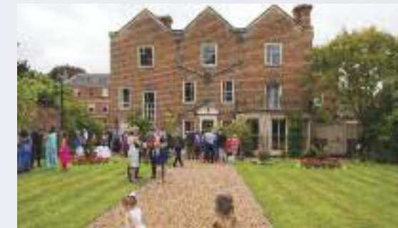
Belgrave Hall & Gardens page 6