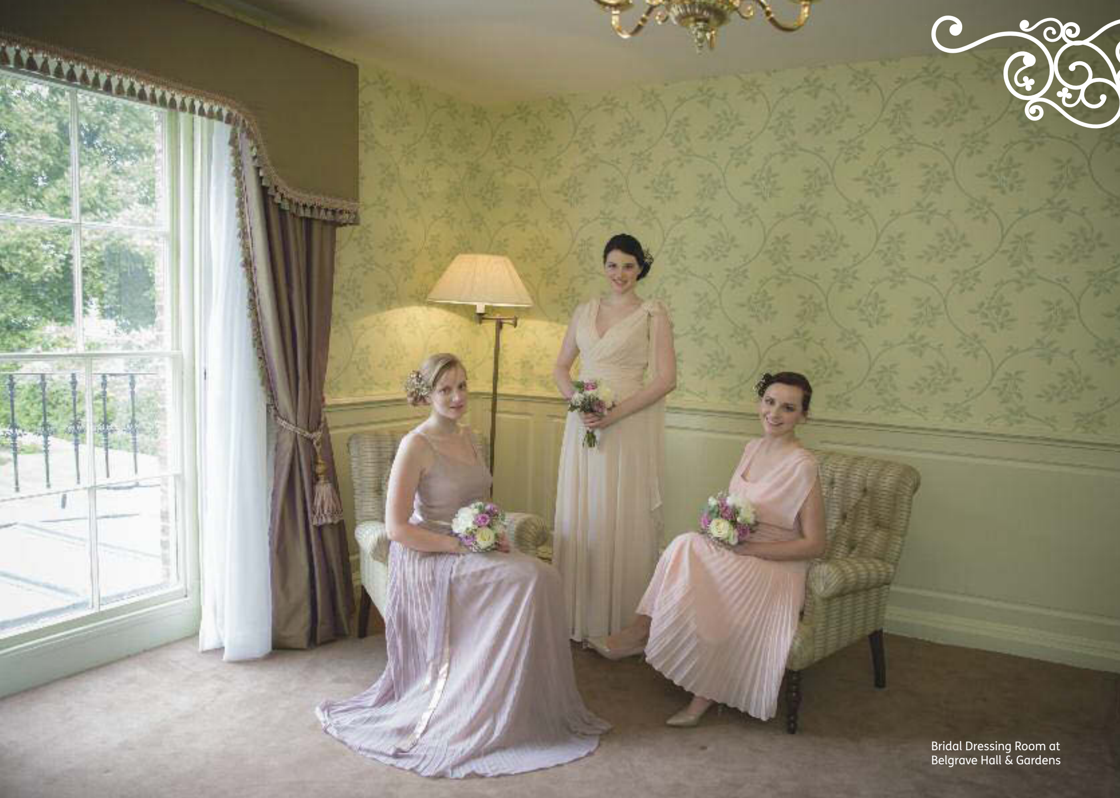
Bridal Dressing Room at Belgrave Hall & Gardens