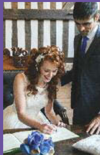
The Guildhall Guildhall Lane Leicester LE1 5FQ T: 0116 253 2569