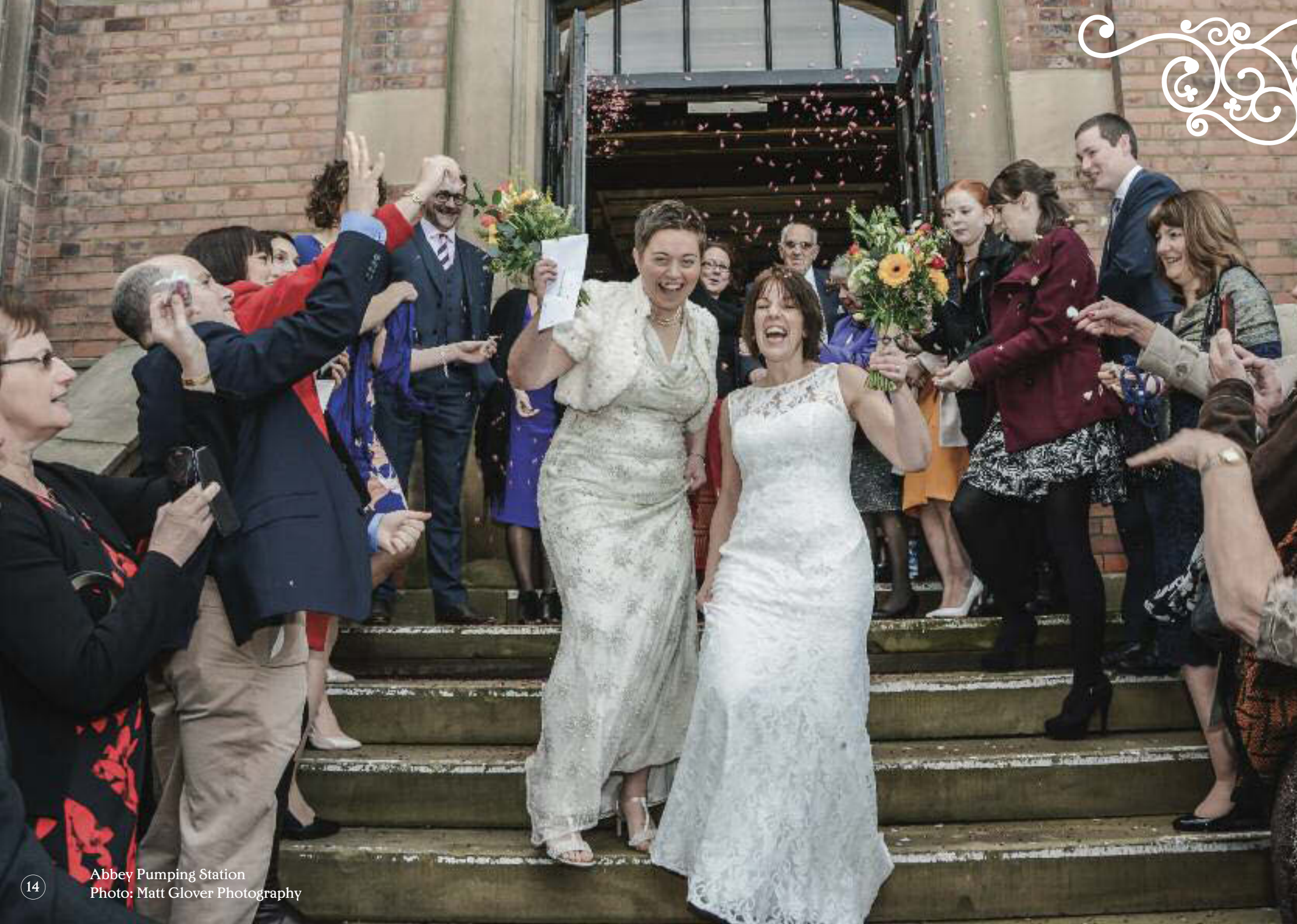
Abbey Pumping Station