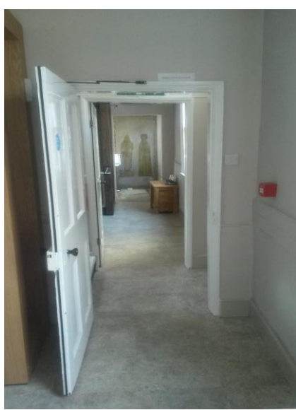
Corridor to the Medieval Galleries.