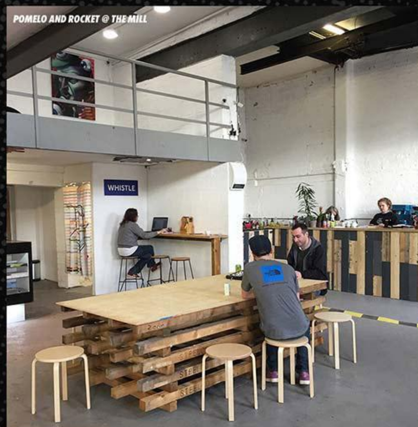
POMELO AND ROCKET @ THE MILL

THE SHED WILL BE RUNNING A FAMILY FRIENDLY MUSIC EVENT BETWEEN 11AM-6PM.