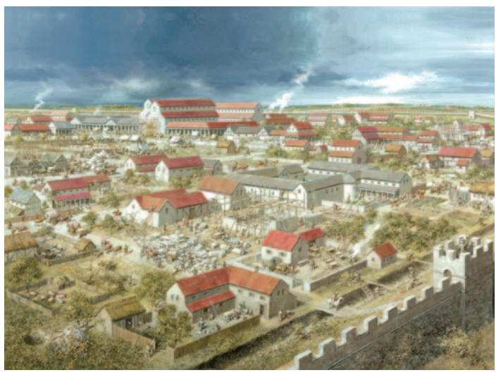
Artist's impression of Roman Leicester in the late 3rd century AD looking south-west.