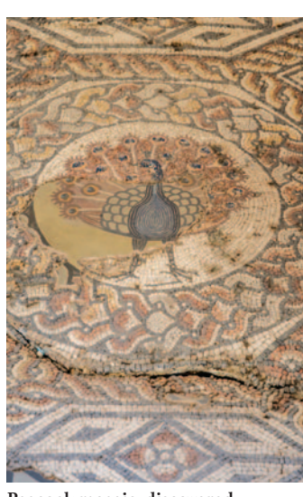
Peacock mosaic, discovered in St. Nicholas Street, 1898.

The main part of the walking trail should take between an hour and 90 minutes to complete, at a moderate pace (stops I-8). It has as an extension of three additional sites (stops 9-II) and a another three a little further afield (stops A-C). We hope that exploring Leicester's busy, multi-cultural streets gives you a flavour of the bustling, diverse Roman city that once thrived here.