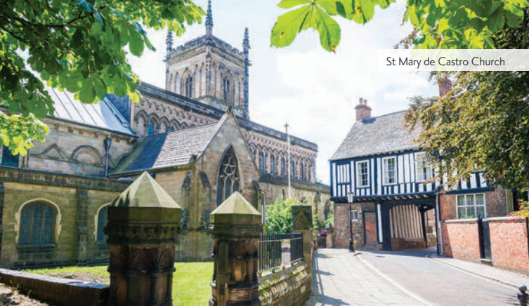
St Mary de Castro Church

Clustered around The Newarke and De Montfort University campus, just minutes from the city centre, are remarkable buildings that tell the story of Leicester from its Roman origins to its manufacturing heyday.