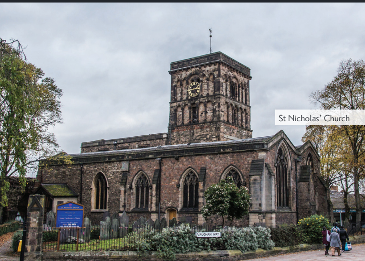
St Nicholas' Church

Built in 1423, the Turret Gateway separated the Newarke religious precinct from Leicester Castle. Locally it is also known as Rupert's Gateway, as Prince Rupert and King Charles I commanded the royalist army that captured Leicester Castle in 1645 during the English Civil War.