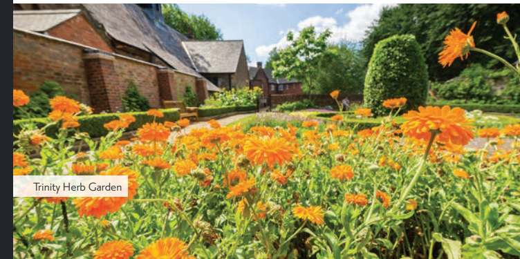
Trinity Herb Garden

The herb garden at Newarke Houses Museum is one of the oldest gardens in Leicester. Together with a later Regency style garden, they provide a beautiful haven for rare plants and wildlife. The Newarke wall can be seen in the garden, complete with gun loops used to defend the area during the English Civil War.