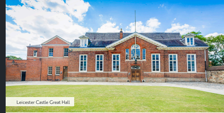
Leicester Castle Great Hall